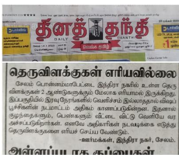
Daily Thanthi Date: 21.1.2022 Page no- 2

Process: During the Ambedkar Children Committee the children discussed about the non-functioning of street lights in their location. Children expressed the fear and thread caused in the evening. The issues has been in presence more than two years. The community members had given petitions several times to city administration but all was in vain. Children planned to address the issues.