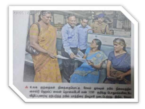
SCHOOL AWARENESS PROGRAMMES

volunteers participated in this event. At Karur railway station Salem CL TEAM AND Karur CL team conducted awareness programme more than 2000 public got aware on this event about CHILDLINE.